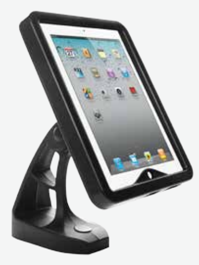
TABLE TOP MOUNT Product: 8.5" x 7.3" x 11.7" Base: 5.8" x 3.5" x 7.3" Weight: 2.3 lbs