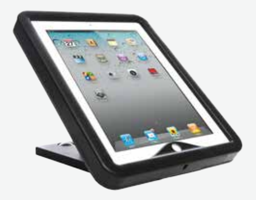
SECURE FLIP Product: 8.5" x 10.5" x 7.6" Base: 3.5" x 2.5" x 7.7" Weight: 2.8 lbs

FLOOR KIOSK Product: 14" x 18" x 48.13" Weight: 31.5 lbs